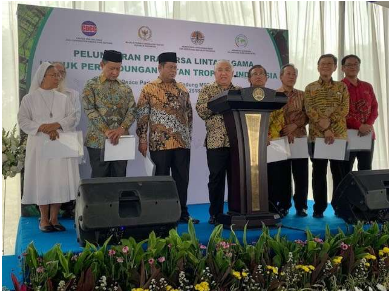
Religions for Peace Launches Historic Movement for Rainforest Protection